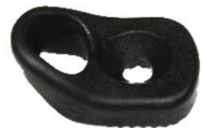
KB15 Hole Size: 5.0mm