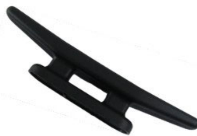
KB7-1 Size: 5"