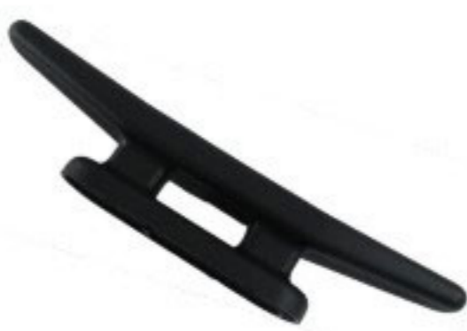
KB7 Size: 4"