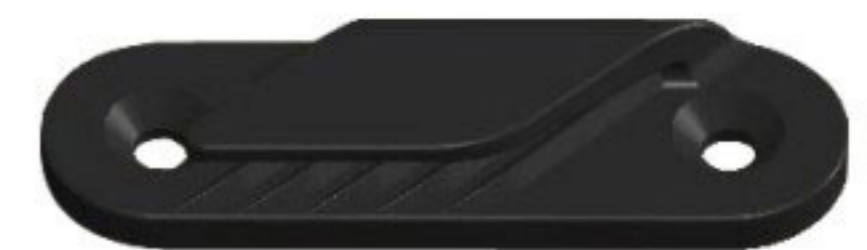
KB10R L= 2-3/4"