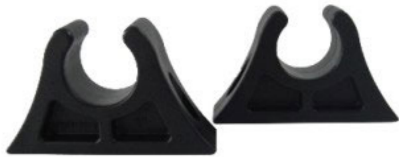
KB13-1B Size: 3/4"