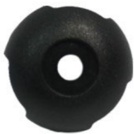
KB2 Hole Size: 1/4mm