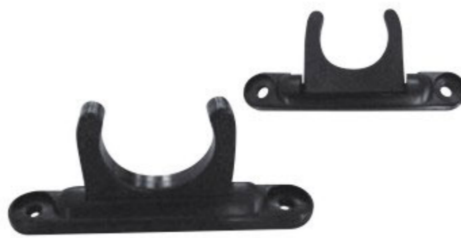
KB11 Size: 1-1/4"