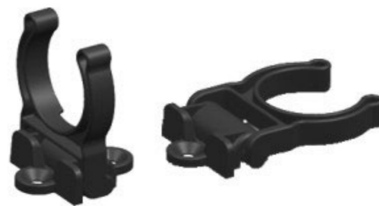
KB14-3B Size: 1-1/4"