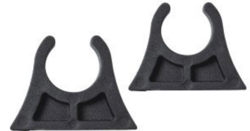
KB13-3B Size: 1-1/4"