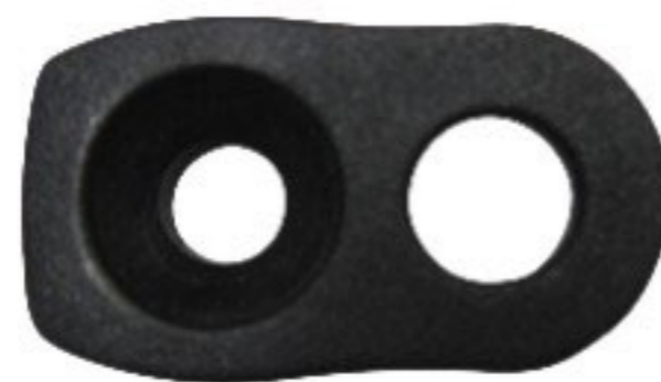
KB17 Hole Size: 6.6mm