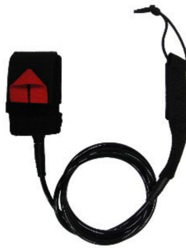
KE2-2 SUP Leash