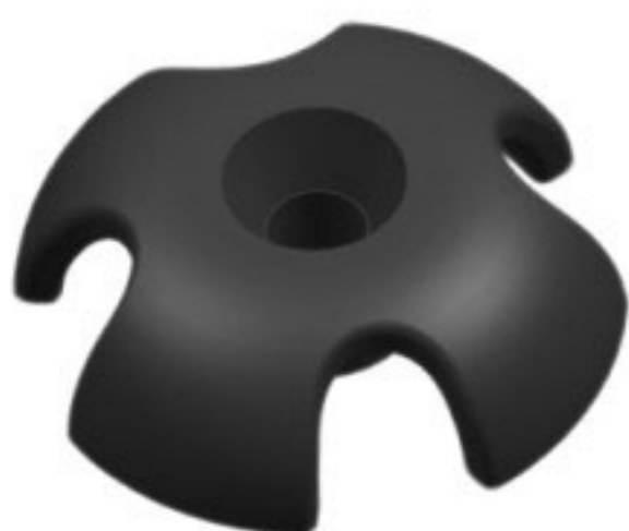
KB8-4B Size: 38mm