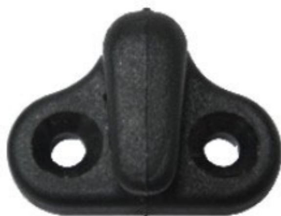
KB16 Hole Size: 3.9mm