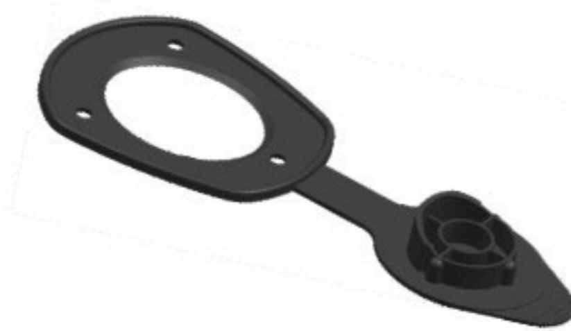
KA20 Fits KA1 & KA2