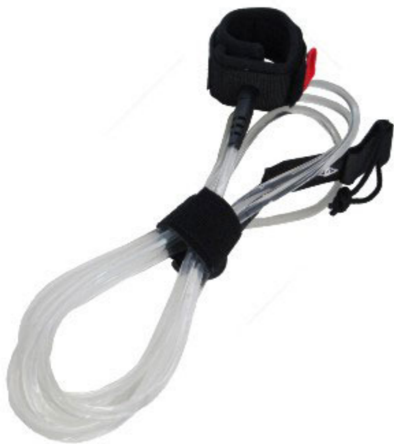
KE2-1 SUP Leash