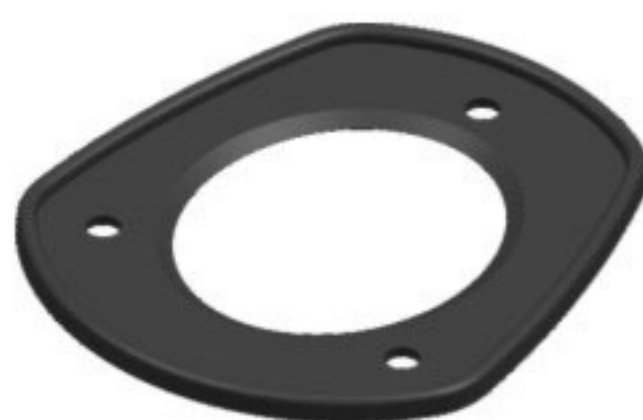
KA22 Fits KA1 & KA2