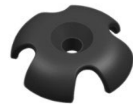
KB8 Size: 30mm