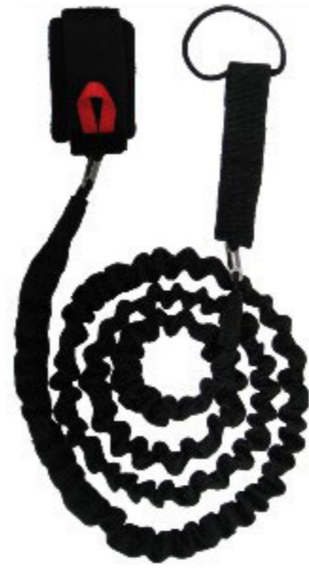
KE1-1 SUP Leash