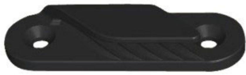
KB10L L = 2-3/4"