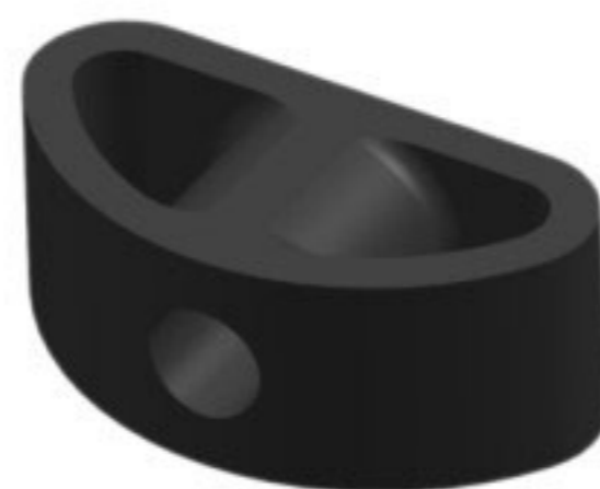
KB9-3B Size: 1-1/4"