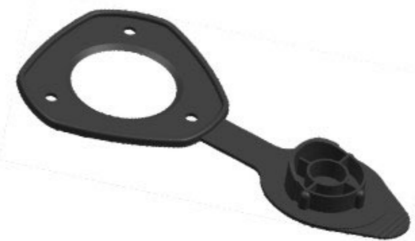
KA21 Fits KA3