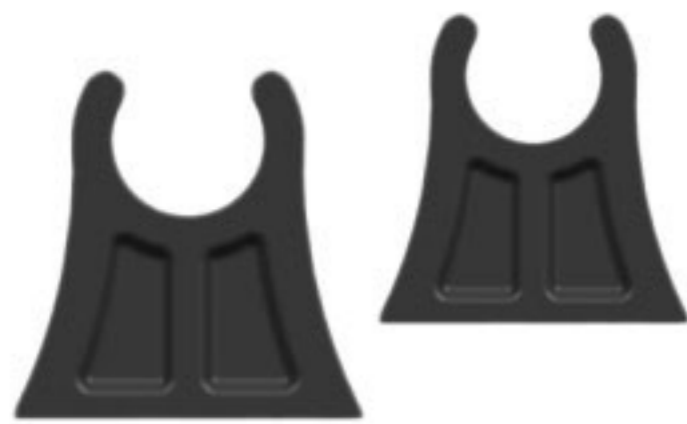
KB13-4B Size: 1-1/2"