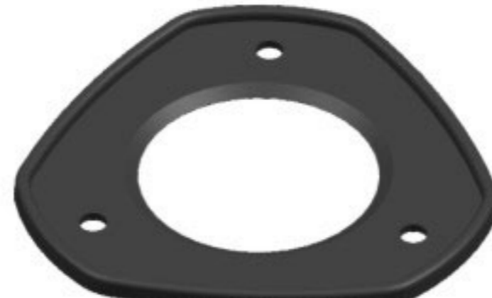
KA23 Fits KA3