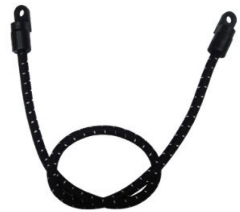
KE6 Reflective Bungee