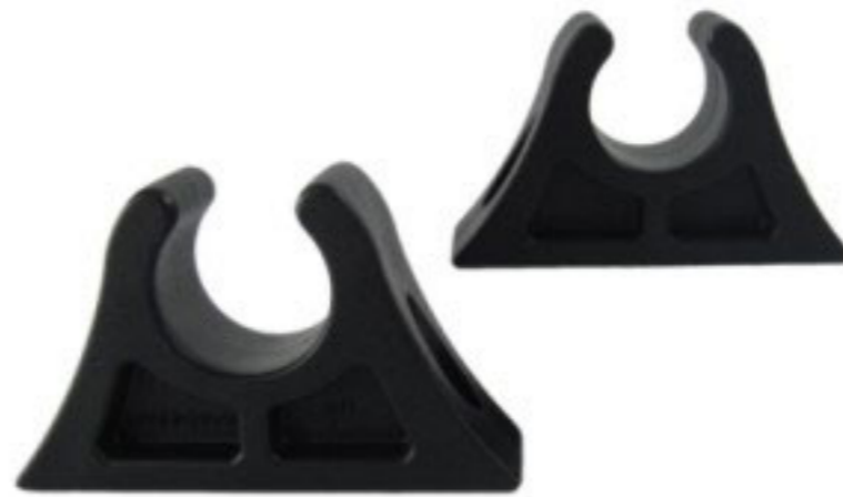
KB13-2B Size: 1"