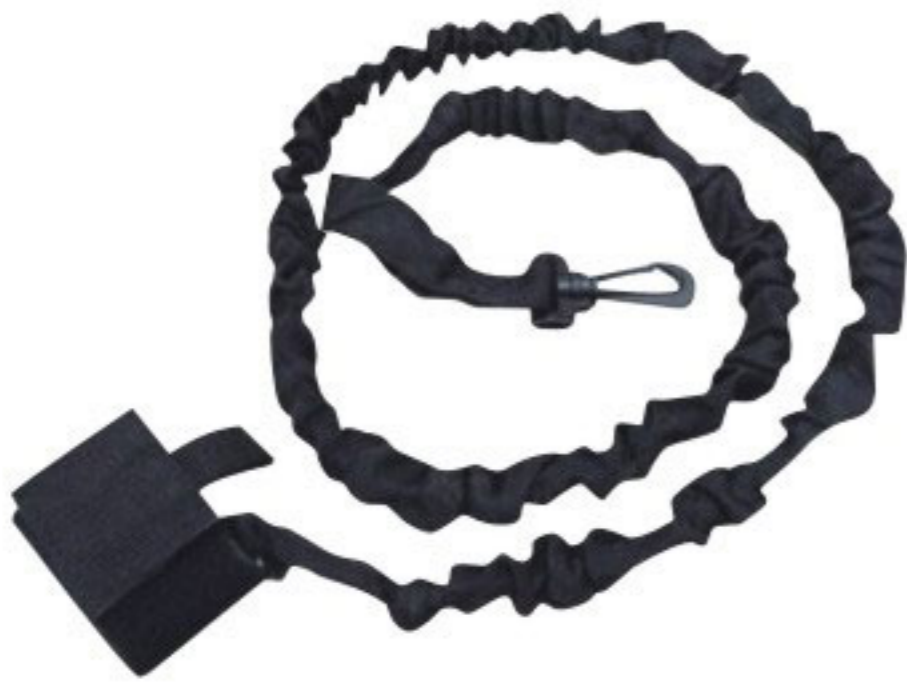
KE1 Paddle Leash